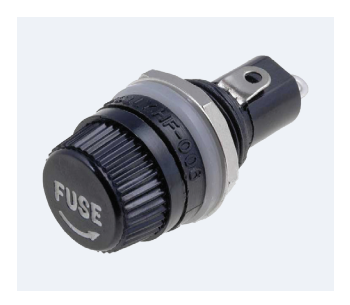
Electric fuse It protects device components in case of failure.