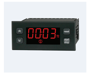
Multifunction time relay To set the required working time.